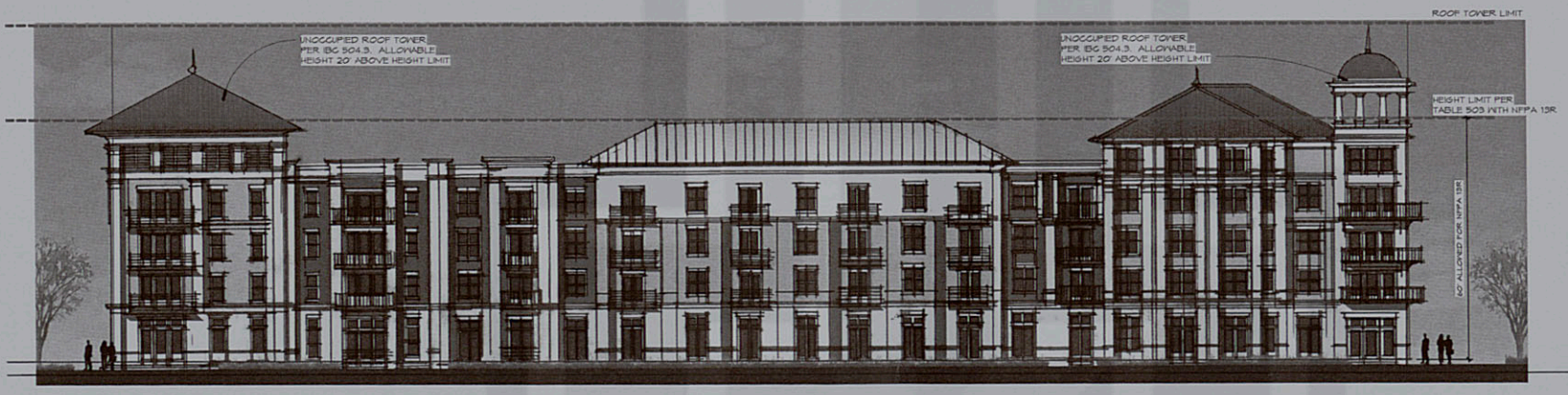
1 SOUTH ELEVATION 1/16" = 1'-0"