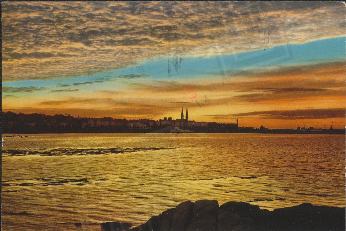
Sunset on Dun Laoghaire and Sandycove, Co. Dublin, Ireland.