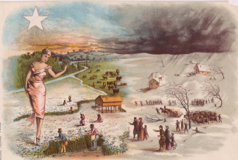
FROM THE BLIZZARD REGION TO TEXAS.

SOUTHWEST COLLECTION Texas Tech University LUBBOCK, TEXAS 79409