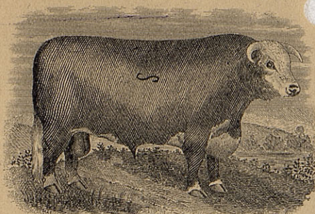
—© ANCIENT BRITON 55749. ©— WORLDS FAIR CHAMPION.