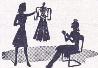
THE CLOTHES LINE

The Tech coed dresses for comfort and neatness. On the campus she wears low-heeled shoes, soft sweaters or blouses, and contrasting skirts, jackets, and suits. Sweaters and skirts are probably the most popular costume for school wear. It is not necessary to have a great number of these. Two skirts, three sweaters, and two or three wash blouses will see you through nicely, if you use discretion and get these in colors that will harmonize so that you may switch them around and make several different costumes. Accessories add variety to this group. A large harmonizing scarf is worn on the head, peasant style, when the sand is blowing. Otherwise, the coed goes bareheaded on the campus.