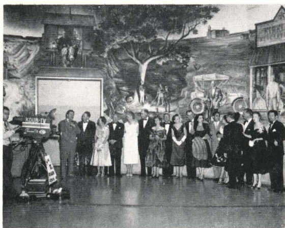
Four panels of South Plains Mural form background for distinguished guests on the Pre-Dedication Television show in Museum Rotunda.

J. Evetts Haley and Tom Lea were unable to attend, though in the Chroniclers Panel.