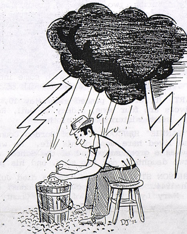
WAY BACK IN '34

Friends like you make this paper possible!