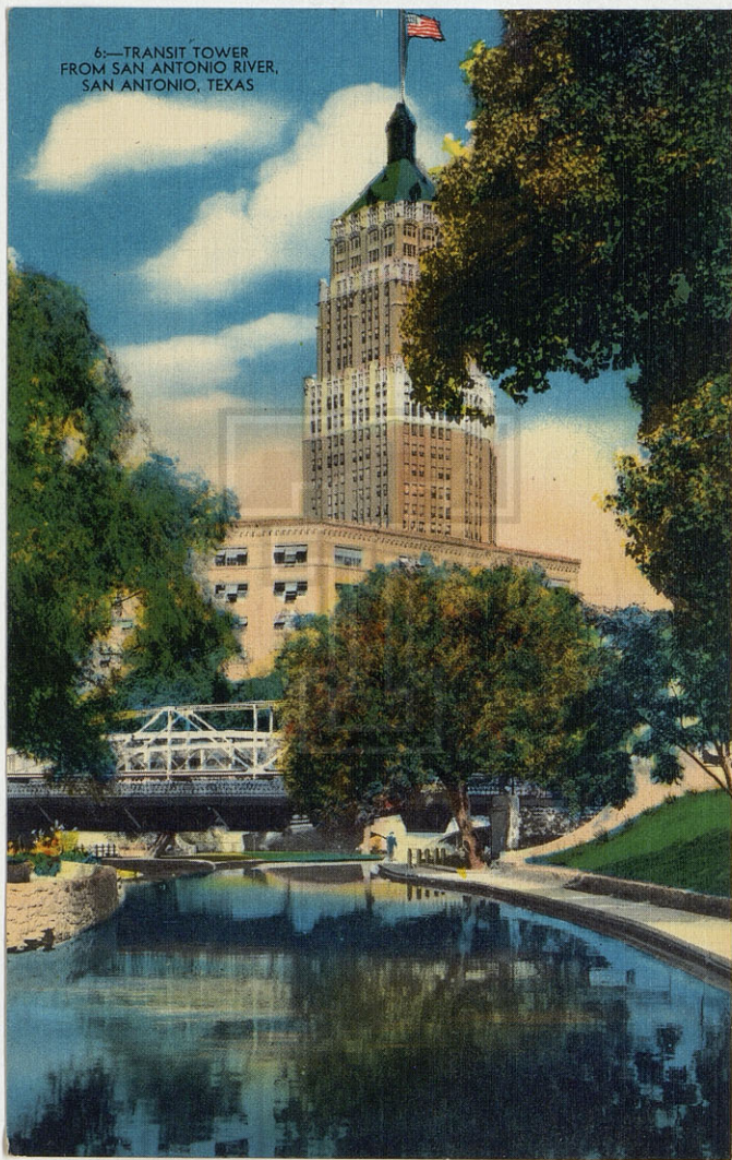
6.—TRANSIT TOWER FROM SAN ANTONIO RIVER, SAN ANTONIO, TEXAS