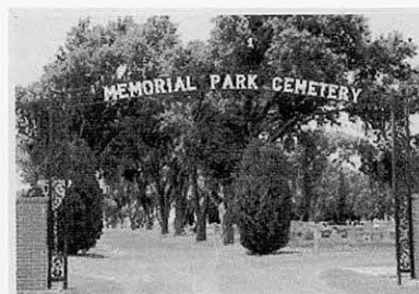
Cemetery

Created by: Ghost family hunter Record added: Jan 30, 2013 Find A Grave Memorial# 104378892