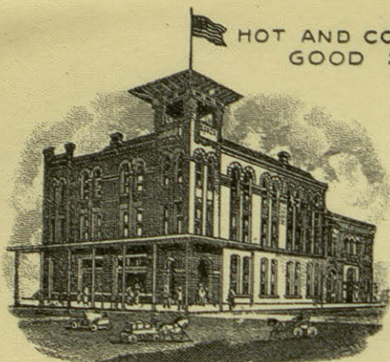
CLARKE & COURTS, BALTIMORE

HOT AND COLD RUNNING WATER GOOD SAMPLE ROOMS