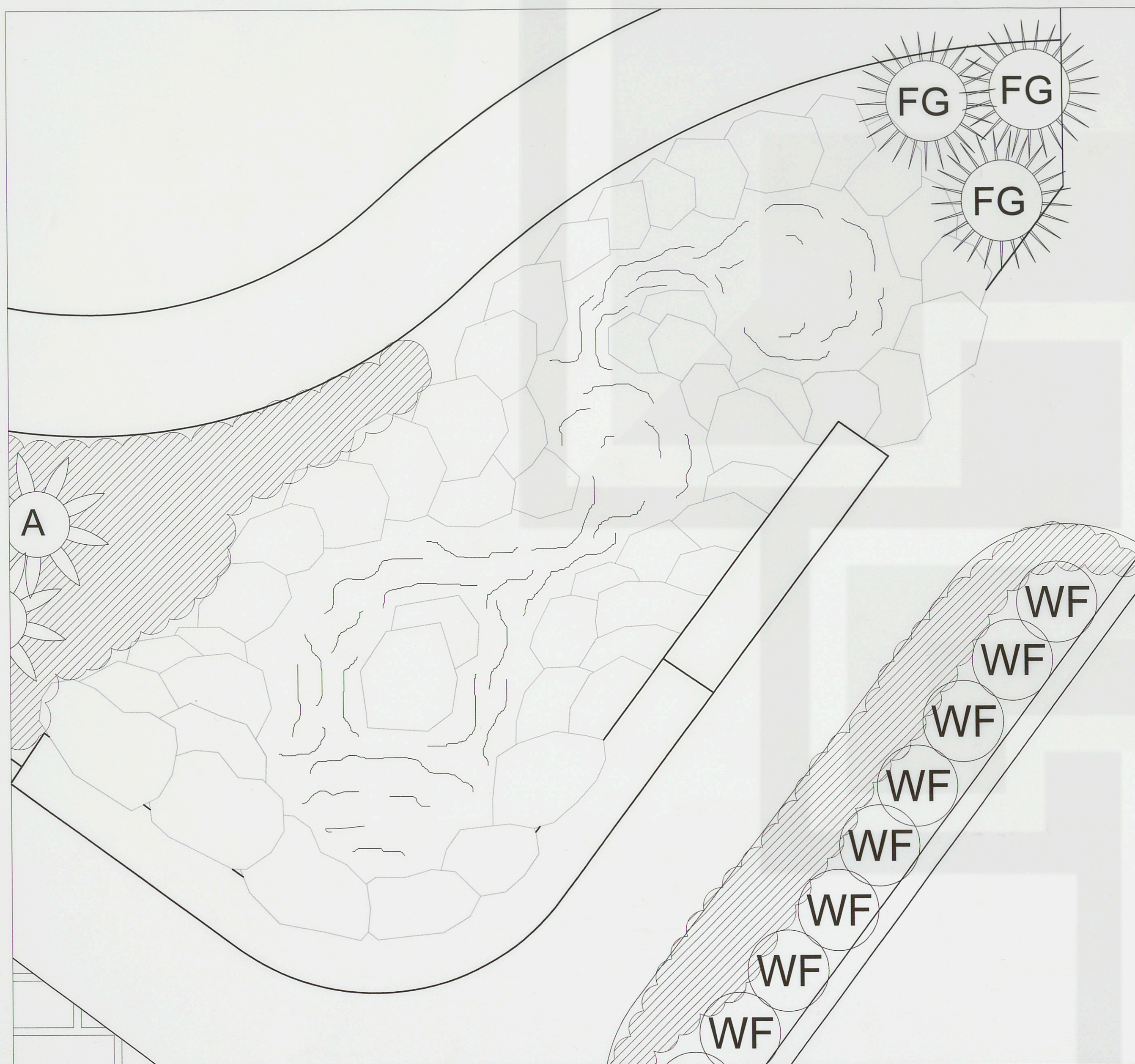
water feature layout