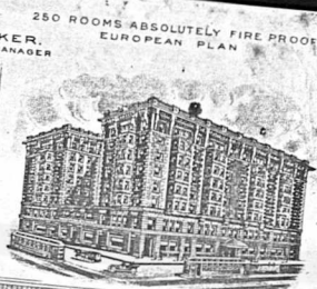
HOTEL CONNOR JOPLIN, MO.