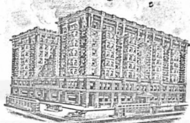
HOTEL CONNOR JOPLIN, MO.