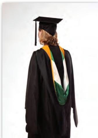
MASTER'S ROBE: Velvet facing around the neck corresponds to color representing the field of study; hood lining represents the colors of the institution that conferred the degree.