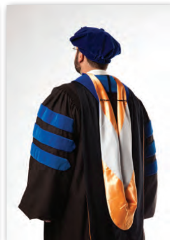
DOCTORAL ROBE: Velvet facing on front of robe and three bars on sleeve correspond to color representing the field of study; hood lining represents the colors of the institution that conferred the degree.

W earing academic dress at commencement ceremonies dates from the early history of the oldest universities created during the twelfth and thirteenth centuries. Because educated people were almost always of the clergy, the black gown is an adaptation of the “cope,” a long mantle or cloak of silk or other cloth worn by church dignitaries in processions and on other occasions. The long gown and cowl (similar to the academic hood of today) were worn by priests and monks for warmth in the cold medieval buildings.